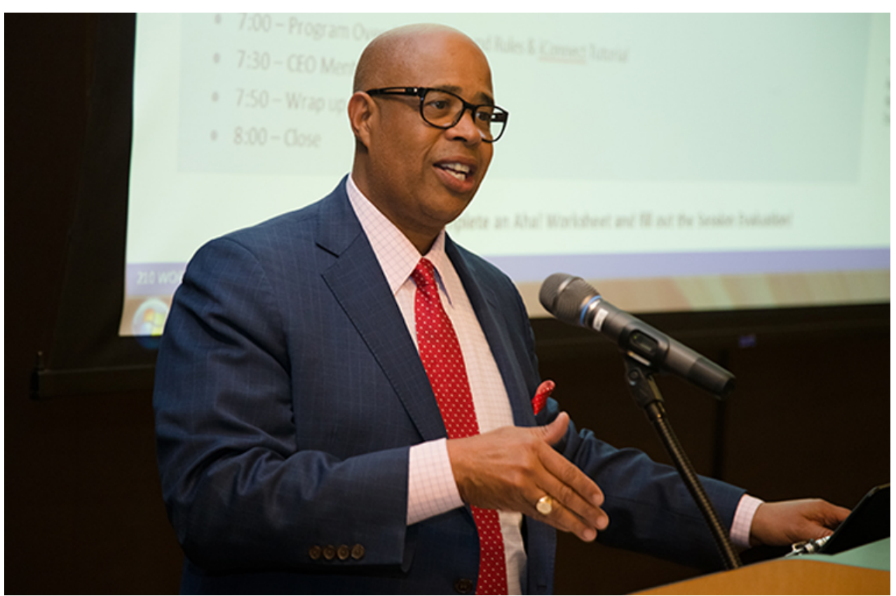
Local Nonprofit Relaunches Nationwide Pitch Competition For Minority-Owned Businesses

(/news/articles/2019/may/direct-to-consumer-app-based-warranty-provider-upsie-raises-5-million)