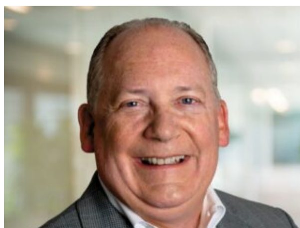
BARTON, WALTER & KRIER P.C