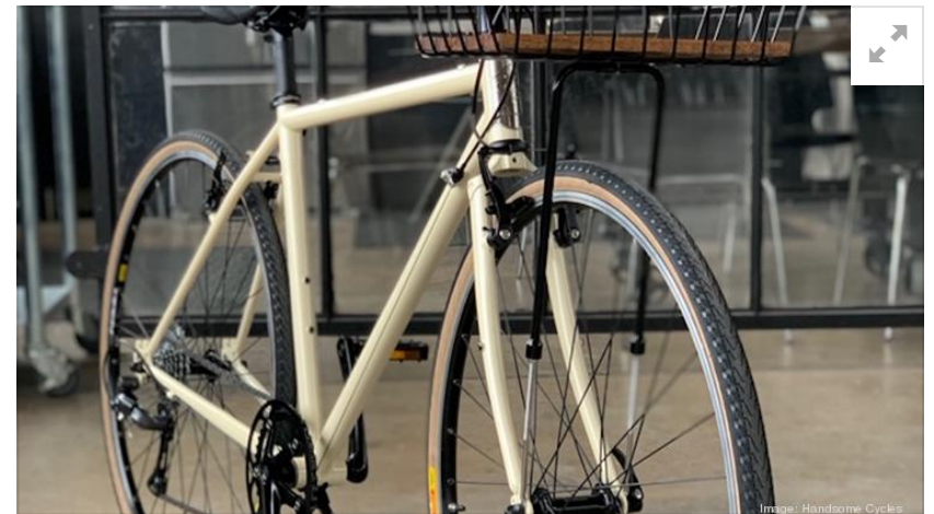
Minneapolis-based manufacturer Handsome Cycles is selling inventory faster than it can be replaced this season.