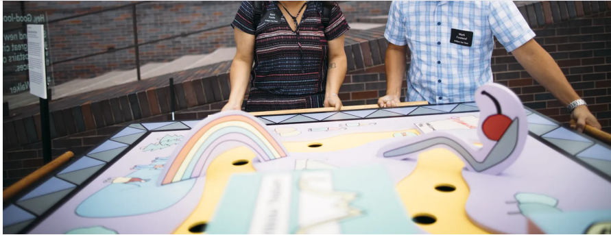
Skyline Mini Golf in 2022.

More than 1,000 artists will take over 70 Northeast Minneapolis galleries, businesses and breweries tomorrow through Sunday for Art-A-Whirl , the self-proclaimed largest open studio tour in the country.